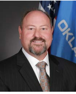
Sen. Kevin Wallace