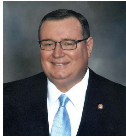
Chancellor Glen D. Johnson

Our state system of higher education continues to keep tuition affordable despite the exceptionally challenging fiscal environment. While tuition costs have increased dramatically in many other states, Oklahoma's public colleges and universities have increased tuition and mandatory fees an average of only 5 percent since the start of the recession in FY09. U.S. News & World Report ranks Oklahoma tuition and fees as seventh-lowest in the nation and student debt at graduation as 10th–lowest in the nation. This distinction follows