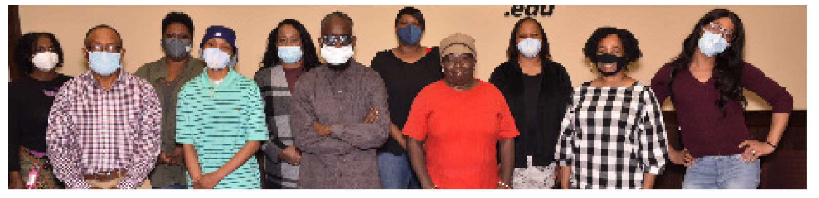
ASSET program participants.