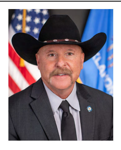
Rep. Rusty Cornwell R-Vinita