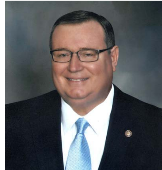
Chancellor Glen D. Johnson

Our state system of higher education continues to keep tuition affordable despite the exceptionally challenging fiscal environment. While tuition costs have increased dramatically in many other states, Oklahoma's public colleges and universities have increased tuition and mandatory fees an average of only 5 percent since the start of the recession in FY09. U.S. News & World Report ranks Oklahoma tuition and fees as seventh-lowest in the nation and student debt at graduation as 10th-lowest in the nation. This distinction follows