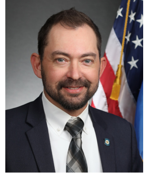
REP. JUDD STROM R-Copan