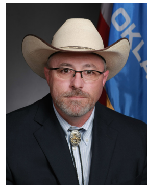
REP. JUSTIN HUMPHREY R-Lane

Data from the National Center for Education Statistics show Oklahoma universities have the eighth-lowest cost of attendance in the nation .