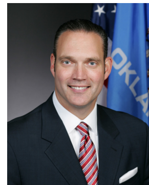
REP. CHARLES MCCALL R-Atoka

Data from the National Center for Education Statistics show Oklahoma universities have the eighth-lowest cost of attendance in the nation .