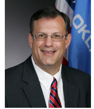
REP. TERRY O'DONNELL R-Catoosa