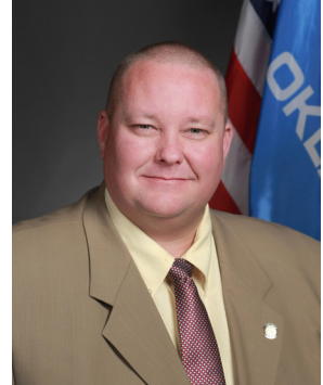
REP. DELL KERBS R-Shawnee