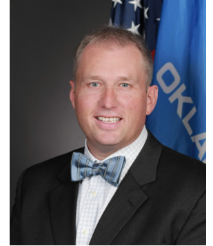
REP. CHAD CALDWELL R-Enid

Data from the National Center for Education Statistics show Oklahoma universities have the eighth-lowest cost of attendance in the nation .