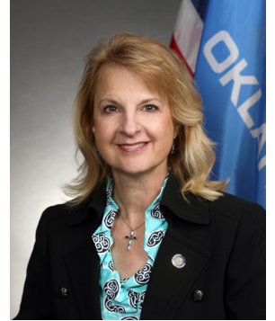
REP. DENISE CROSSWHITE HADER R-Piedmont

Data from the National Center for Education Statistics show Oklahoma universities have the eighth-lowest cost of attendance in the nation .