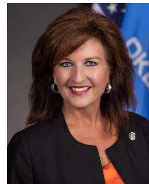
REP. TAMMY TOWNLEY R-Ardmore

Data from the National Center for Education Statistics show Oklahoma universities have the eighth-lowest cost of attendance in the nation .