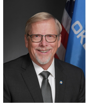
REP. CARL NEWTON R-Cherokee