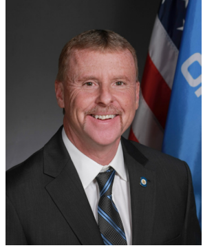
REP. RUSTY CORNWELL R-Vinita