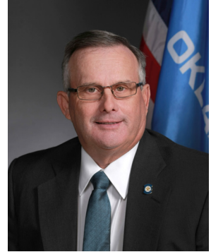
REP. KENTON PATZKOWSKY R-Balko