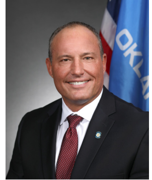
REP. STEVE BASHORE R-Miami

Data from the National Center for Education Statistics show Oklahoma universities have the eighth-lowest cost of attendance in the nation .