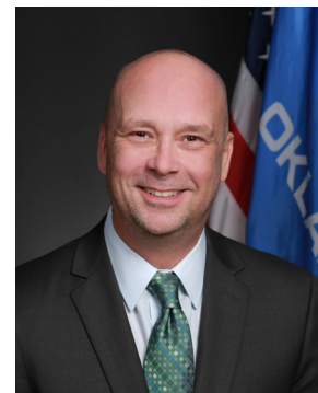
REP. MIKE OSBURN R-Edmond

Data from the National Center for Education Statistics show Oklahoma universities have the eighth-lowest cost of attendance in the nation .