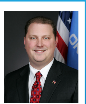
REP. JON ECHOLS R-Oklahoma City