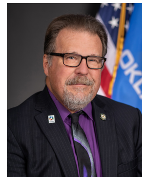
SEN. MICHEAL BERGSTROM R-Adair

Data from the National Center for Education Statistics show Oklahoma universities have the eighth-lowest cost of attendance in the nation .