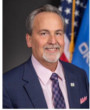
SEN. BILL COLEMAN R-Ponca City