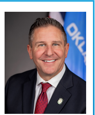
SEN. TODD GOLLIHARE R-Kellyville