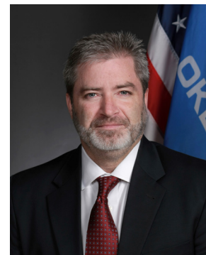
SEN. ROB STANDRIDGE R-Norman

Data from the National Center for Education Statistics show Oklahoma universities have the eighth-lowest cost of attendance in the nation .