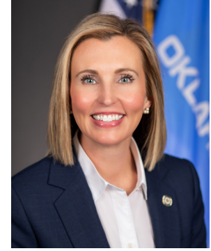
SEN. KRISTEN THOMPSON R-Edmond