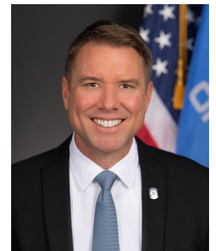
SEN. JOE NEWHOUSE R-Tulsa