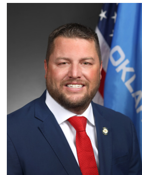
SEN. CODY ROGERS R-Tulsa