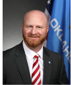
SEN. BRENT HOWARD R-Altus