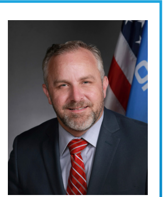
SEN. GREG TREAT R-Oklahoma City