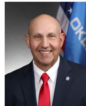
SEN. DEWAYNE PEMBERTON R-Muskogee

Data from the National Center for Education Statistics show Oklahoma universities have the eighth-lowest cost of attendance in the nation .