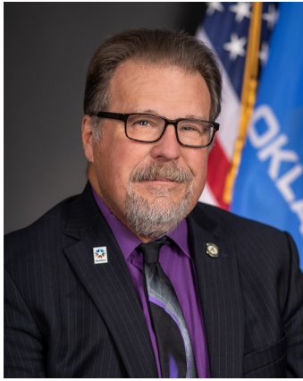
Sen. Micheal Bergstrom R - Adair